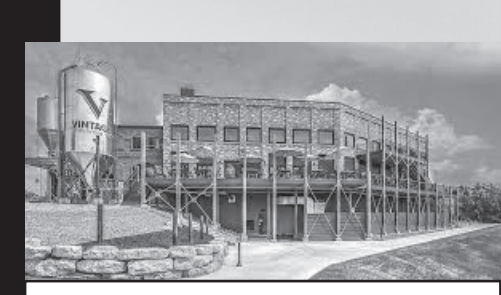
Located at the Vintage Brewing Compan on the shores of the Wisconsin River

5:00 PM Doors Open 6:30 PM Dinner LAST Raffles Drawn 9:00 PM